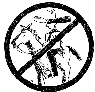
No Lone Rangers

To achieve change on campus, prevention committees must provide opportunities and incentives for all members of the campus community to become involved, including students, faculty, all levels of staff, par-